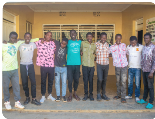
10 of the 13 boys to attend High School this year.