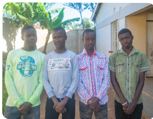
4 new boys to attend High School