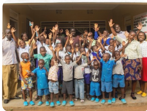
38 Boys saying Thank You for the food in their bellies, the clothes on their back, and their Brighter Tomorrow!